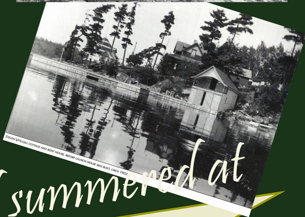
STEVEN'S HUGILL COTTAGE AND BOAT HOUSE, BEFORE LAUNCH HOUSE WAS BUILT, CIRCA 1902